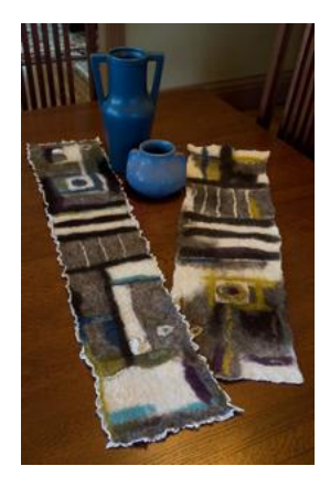
Felted Table Runner Leslie Granbeck $70