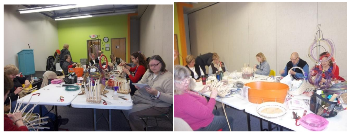
Everybody is concentrating on their basket for the service project-baskets for the Alexander House, a shelter for women.