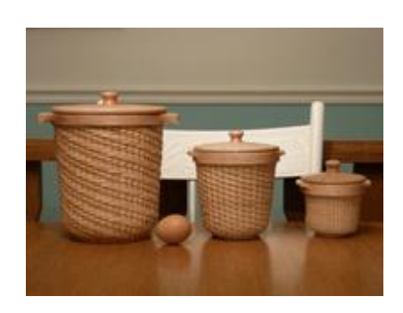
Nesting Nantuckets Shirley Mount S $40, M $45, L $50