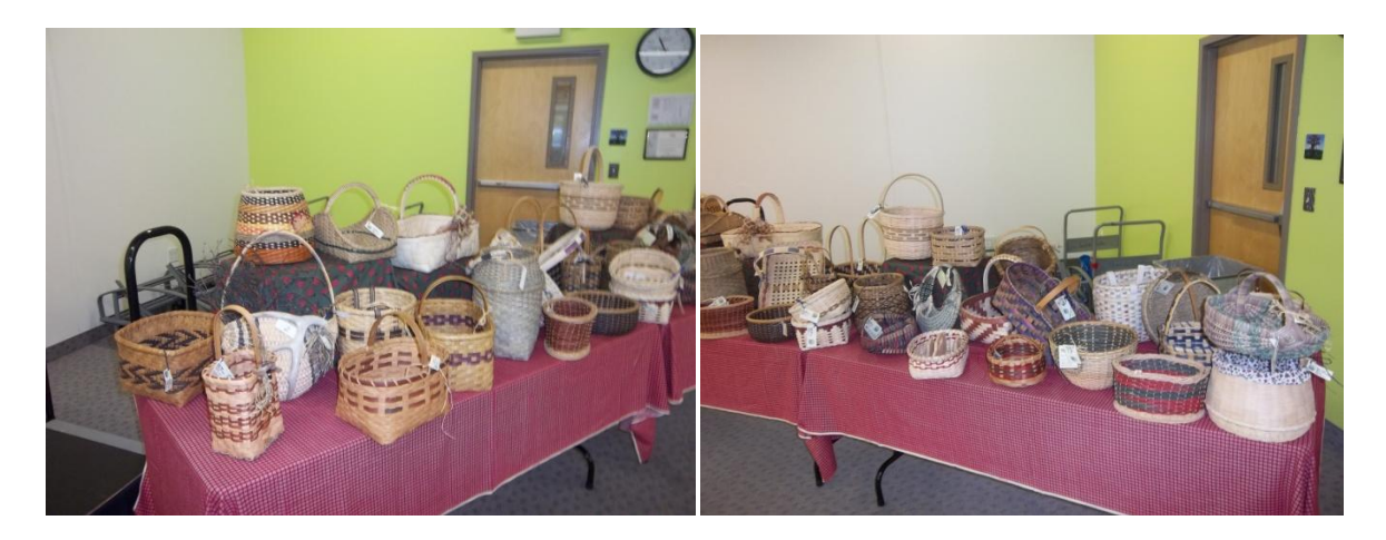
Look at all the baskets! These baskets are for the big bingo win.