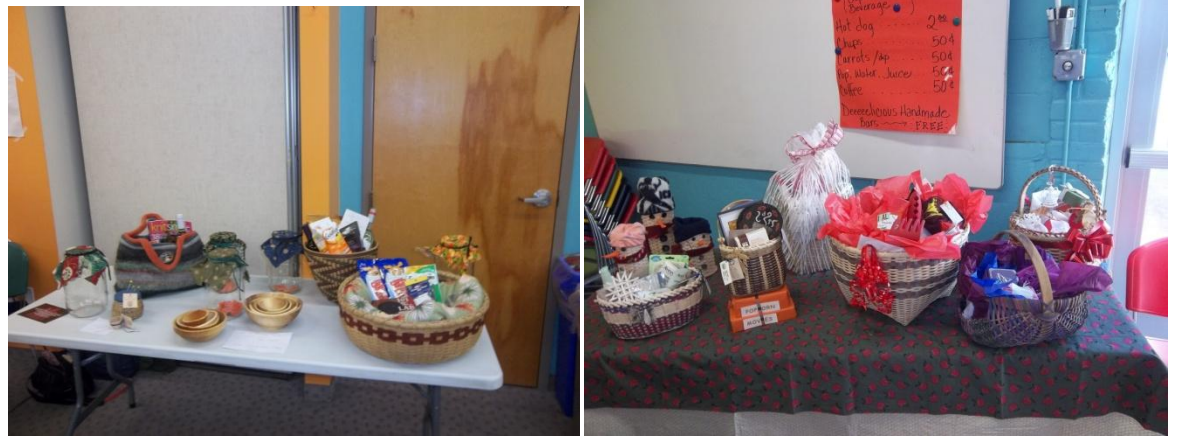
The baskets and bowls were for the bucket raffle. And these large filled baskets were for the big raffle prizes (along with our food price list)