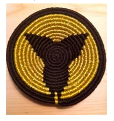
Trillium Coiled Basket Tressa Sularz $45