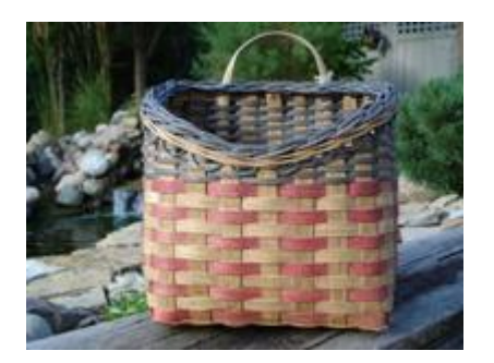
Plaited Heart Shaped Basket Louanne Hipp $30