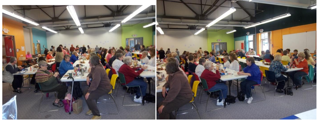
What a great looking crowd that day. An awesome time was had by all.