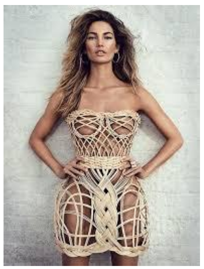
Are we ready to sign up for this weaving class?

Hello, Basket Makers! This is a reminder that our membership year runs January through December. The $25.00 due is one of the best bargains in town!!!