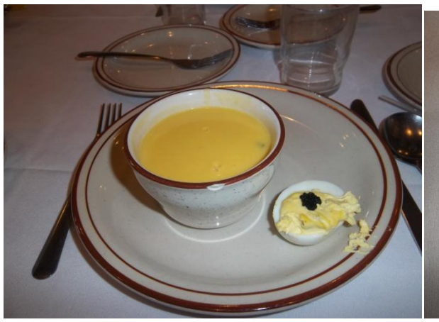
The starter plate for the banquet-cream of And we made lots of new friends too!!! veggie soup and deviled egg with caviar.