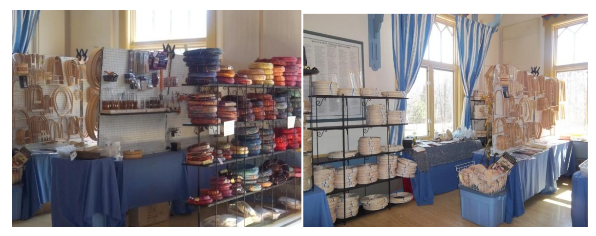
The store-Atkinson's Country House.