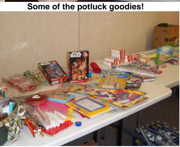
More stuff for more baskets.