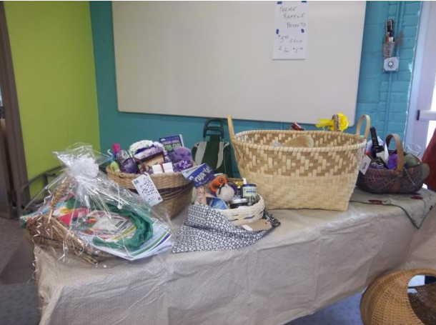
Bucket raffle baskets.....