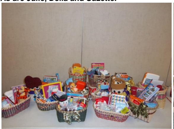
Some of the baskets made and filled. We finished with 19 baskets! Great job!